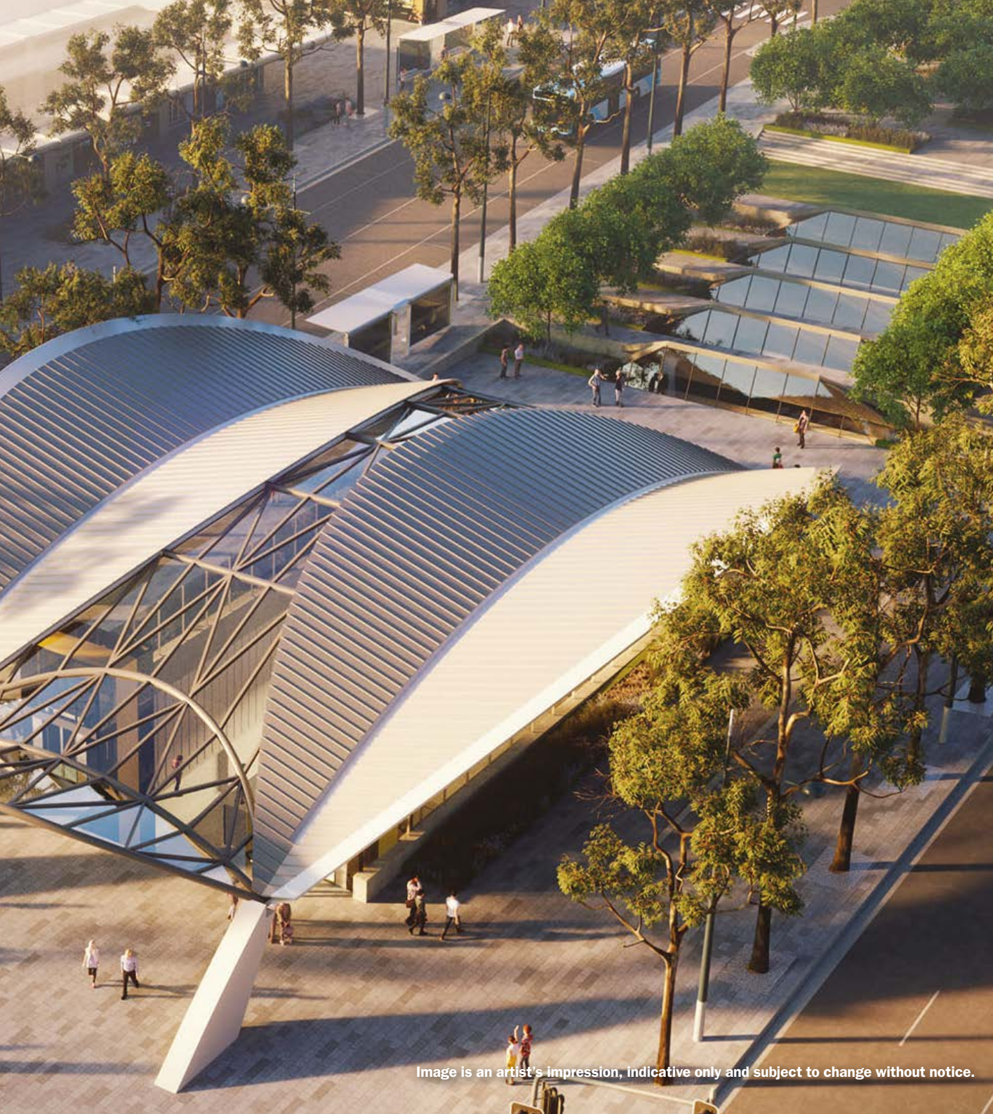
Image is an artist's impression, Indicative only and subject to change without notice.