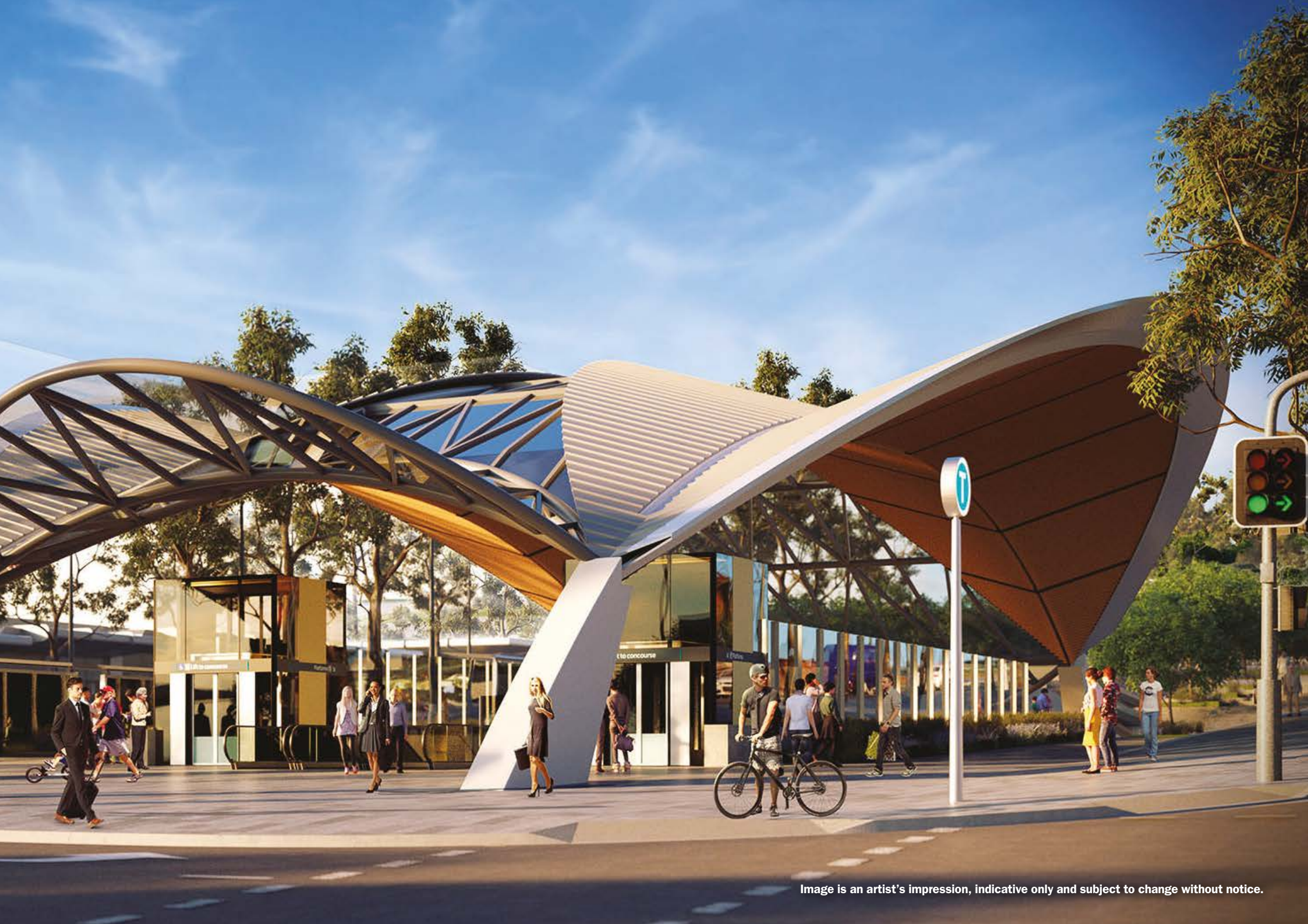
Image is an artist's impression, indicative only and subject to change without notice.