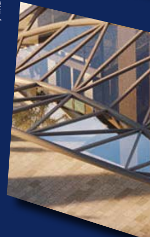
Image is an artist's impression, indicative only and subject to change without notice.