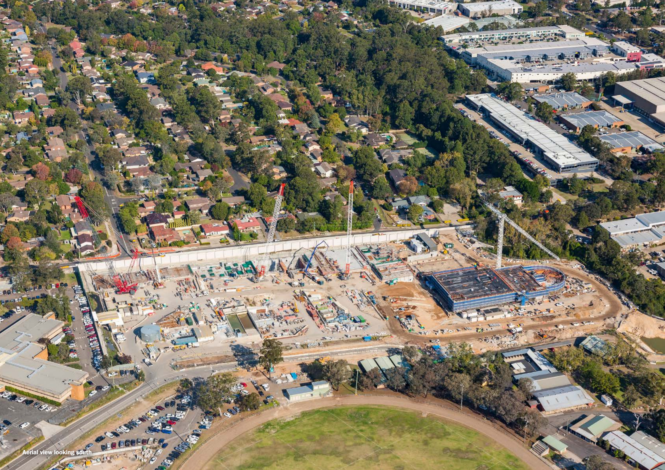
Aerial view looking south